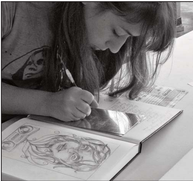
Student working in Printmaking class

Please write a brief statement about your artwork and what you would like to learn from the NYSSSA School of Visual Arts. Please feel free to use extra paper if you wish.